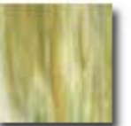
Autumn Green AG