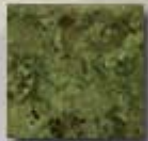
Bronze Patina BP