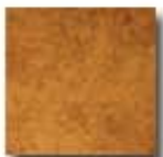
Warm Brass WB