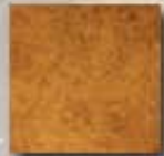
Warm Brass WB