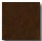
Mottled Bronze MB