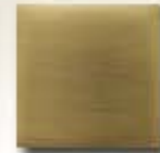
Old Brass OB