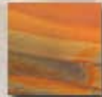
Old Penny OP