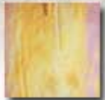
Gold Iridescent GI