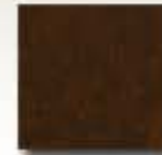
Mottled Bronze MB