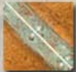
New Verde NV