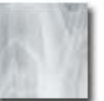
Wispy White WW