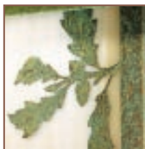
Oak & Acorn