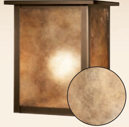
AM: Almond Mica