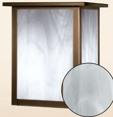
WW: Wispy White