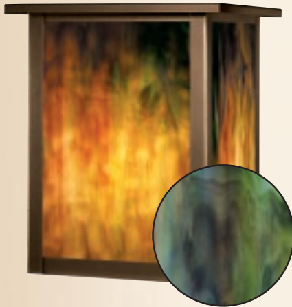
GG: Gold & Green